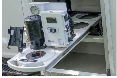
HD TM-7 Hybrid