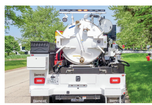
Slide and tilt 250 gal spoils tank