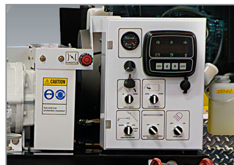
All major systems and operating controls are located curbside for operator safety