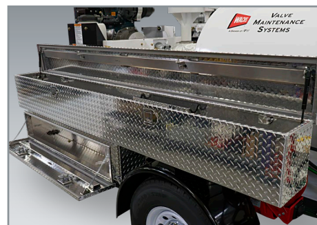
Expanded storage with locking diamond plate watertight job boxes for added security