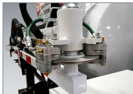
ERV-750 uses unique disk brake system for rigidity, and hydraulic sensors for true hands-free operation