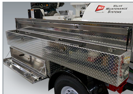
Expanded storage with locking diamond plate watertight job boxes for added security