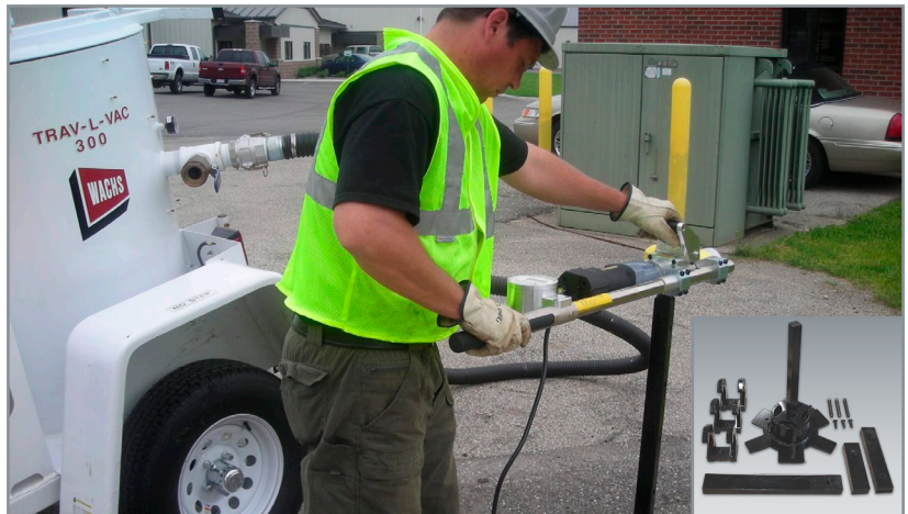
P-2 sets up quickly with one man operation

**Factory rated continuous High Torque (low speed)