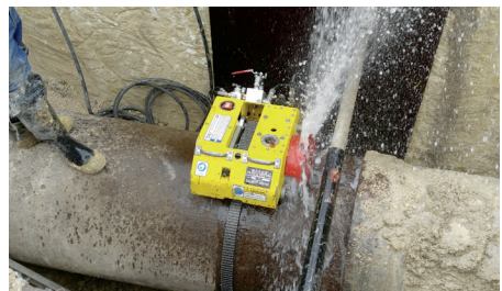
Severing a water pipe under pressure, the Trav-L-Cutter stays on track

Wachs Trav-L-Cutter is versatile and adaptable to various environments where cuts are needed