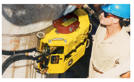
Highly versatile, the Trav-L-Cutter can cut vertically, horizontally or anything in between