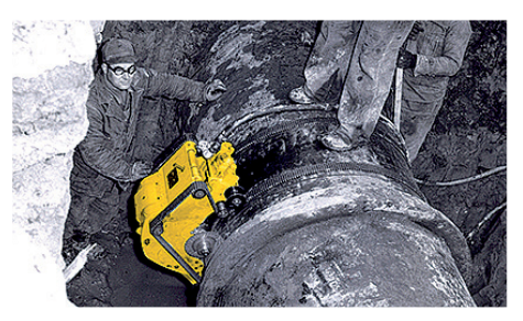
First introduced in 1949, Trav-L-Cutters are highly durable and in use all over the world