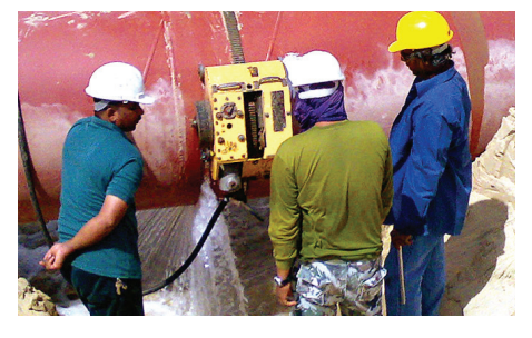
One Trav-L-Cutter can operate on multiple pipe diameters by adding additional chain sections