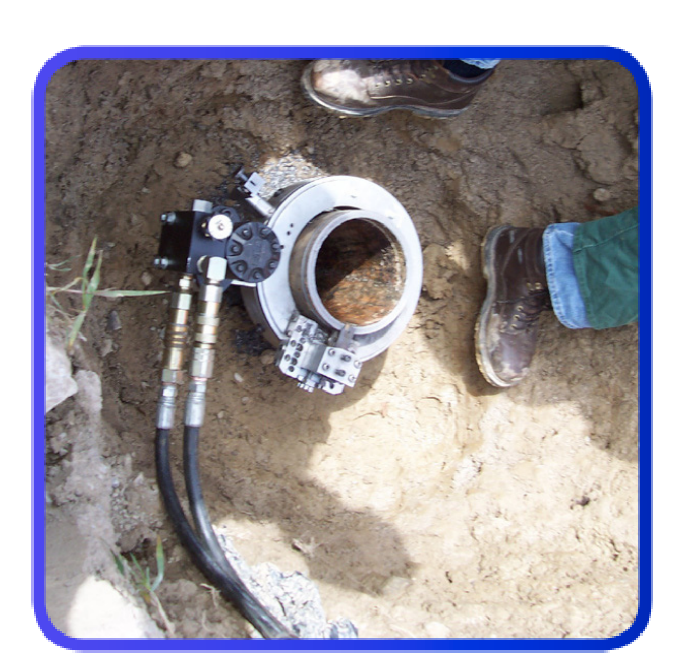
Above: Shown w/ optional Hydraulic Drive Below: Cut groove close-up