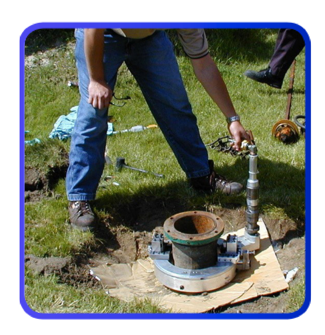
CONTACT YOUR WACHS REPRESENTATIVE FOR ADDITIONAL INFORMATION

PORTABLE HYDRANT MACHINE KIT FOR CUTTING/GROOVING 4" TO 8" DIA. PIPE