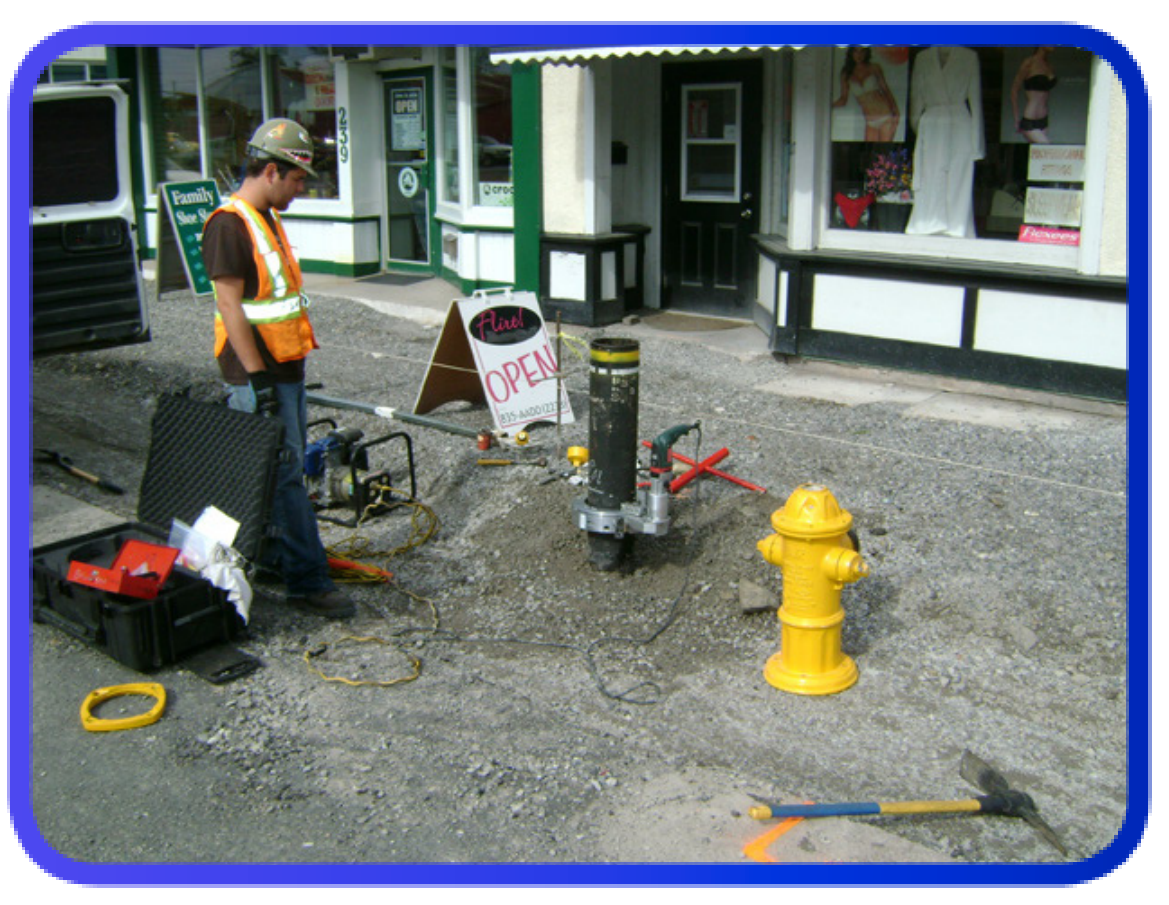
Remove hydrant and install the Wachs' portable split frame cutting and grooving machine