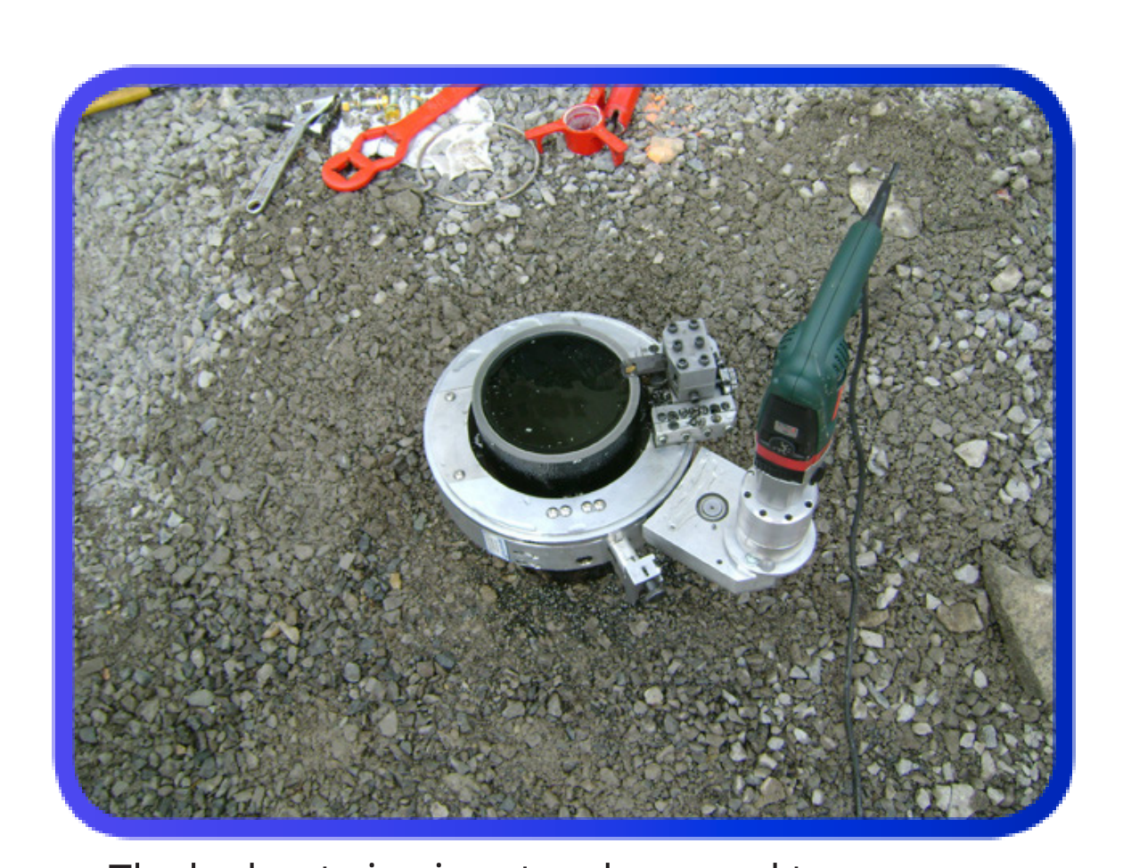
The hydrant pipe is cut and prepped to mount at the correct grade