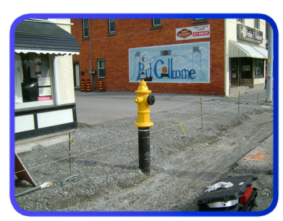
6' Hydrants installed on Main that varied from 2' to 3' below grade